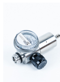
Fixed flow regulator